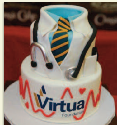
Centerpiece courtesy of Classic Cakes.