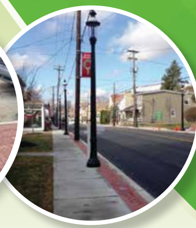
Honey Brook Borough

“ We firmly believe that these streetscape projects will have a positive impact on taxable assessments as properties sell, and will have a positive impact on taxable assessments by bringing in new development and retail to our small town character community.”