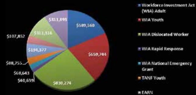
Amount Funded for Services in 2014 Workforce Development - $3,203,051