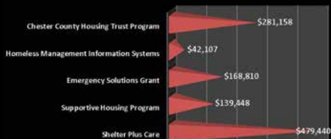
Amount Funded for Services in 2014 Homeless Shelter - $1,110,963