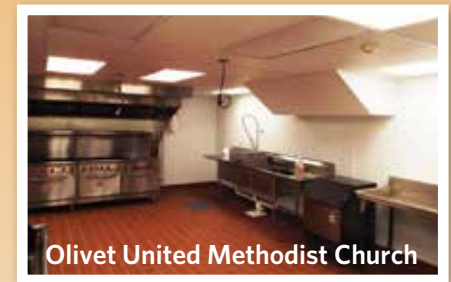
Olivet United Methodist Church

“ I don't get hurt in my house anymore. My house is actually a home now.”