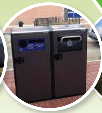
West Chester Borough